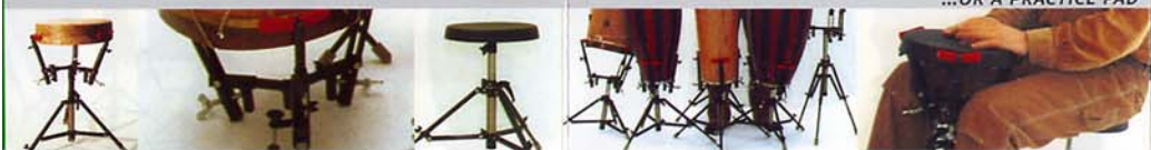
...OR A PRACTICE PAD