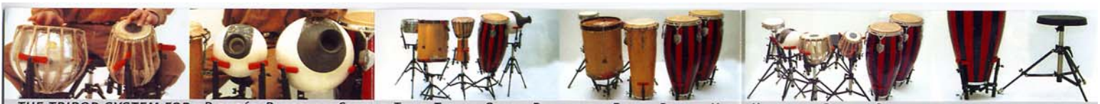
THE TRIPOD SYSTEM FOR: DJEMBÉS BUGARABU CONGAS TOMS TABLAS SABAR DARABUKAS FRAME DRUMS UDUS KPANLOGO DRUMS OBRENTEN... ...AND ALSO A SEAT

"THE UNICAT'S VARIABLE ADJUSTMENT SYSTEM MEANS YOU CAN FIX ANY SIZE OR SHAPE OF DRUM INTO IT SO THAT EVEN DRUMS WITH UNUSUAL SURFACES CAN'T SLIP OUT." "UDU DRUMS, CONGAS OR DJEMBES ALL FIND A RELIABLE PARTNER IN THE UNICAT'S STABLE AND TRUSTWORTHY SUPPORT. INFACIT, THE UNICAT TRIPOD MAKES THE WHOLE BUSINESS OF ASSEMBLY EASIER AND PUTS AN END, ONCE AND FOR ALL, TO THE HEADACHE OF SETTING UP DIFFERENT KINDS OF DRUMS. WE CAN ALSO CERTIFY THAT THIS IS A WELL-MADE PRODUKT." TEST STICKS 07/2001